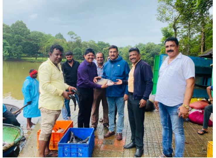
SeaMC 2 participated in the Fish Festival at Pilikula, Mangalore