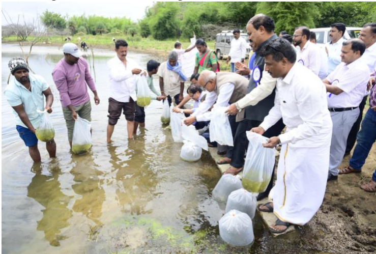
Endemic fish species Barbados carnaticus were released to Hesaraghatta reservoir on 10.07.25