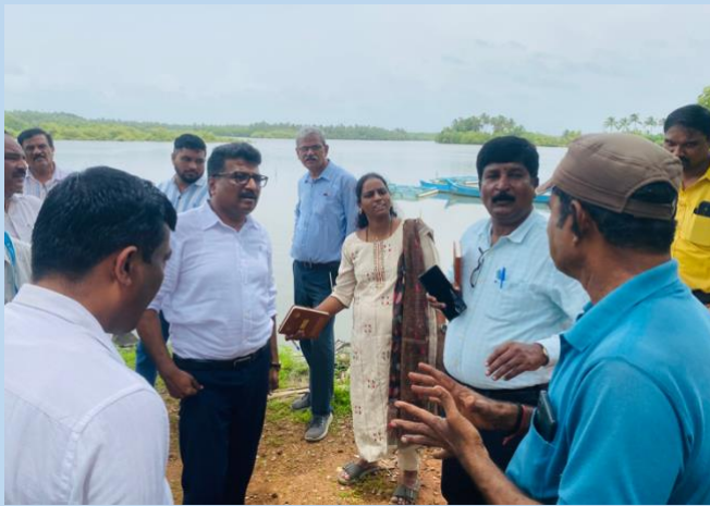
Conflict Management and stakeholder's meeting at Kodi-Kanyana. Along with the Department of Forest, Mines and Geology, CRZ officials and Dept of Fisheries inspected the site for rejuvenation